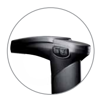
Standard T Style Arm (SM) Black Nylon, with push buttons and soft urethane arm pad.